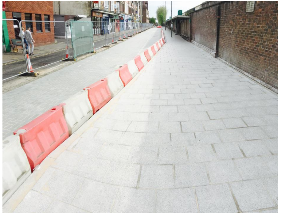
The south side of The Broadway looking east.

The planned completion date for The Broadway has been moved back to the end of July. The reason for this extension is due to the need for forward planning underground utilities that will prevent the need to dig up the new road surface in the future.