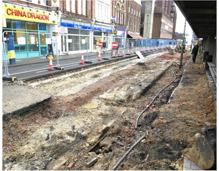
Full excavation of the south side of Broadway.

The extensive utility works on the northbound carriage way of Victoria Way – see photo below – demonstrates why it has been essential to redirect traffic around Goldsworth Road and Church Street West.