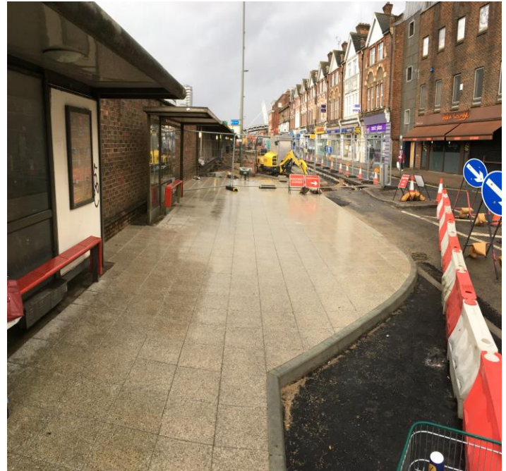
Stanley Road end of Broadway. New paving shows how all of the south side will look in eight weeks.

We have some more work to do to with our specialist advisors and expect to be in a position to announce details of the proposed access arrangements at the end of March.