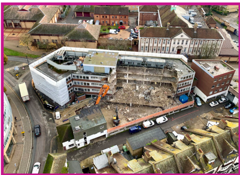
During the demolition. The view from the New Central development of Lynton House (left) and Jubilee House (right).

If you have a view of the site, you will see that Lynton House and Jubilee House have been demolished to ground level, and the same works to Southern House are near completion.