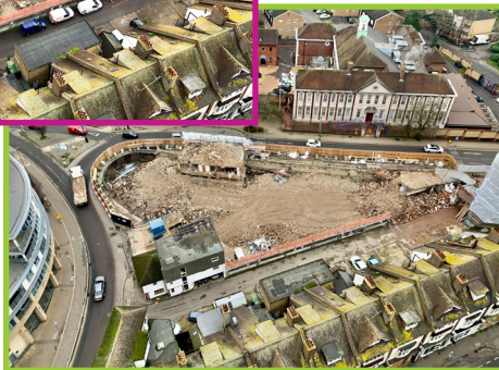
After demolition. The view of the cleared site where the former Lynton House and Jubilee House once stood.

Once the remaining utility services have been disconnected, the footprint of the old office buildings will be covered with a hard-core surface to create a solid, flat base.