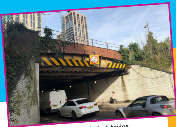
Existing Victoria Arch bridge

Demolition of the Triangle site – external demolition works will start on 28 September 2020.