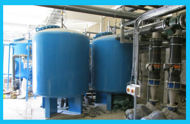
The water pumps and filters for both pools have been nstalled