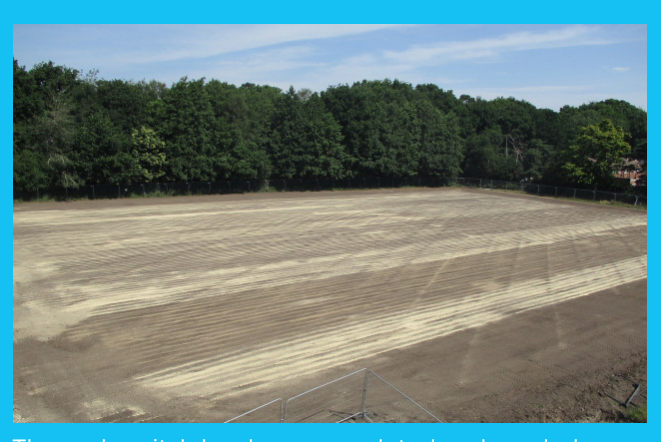
The rugby pitch has been completed and seeded.