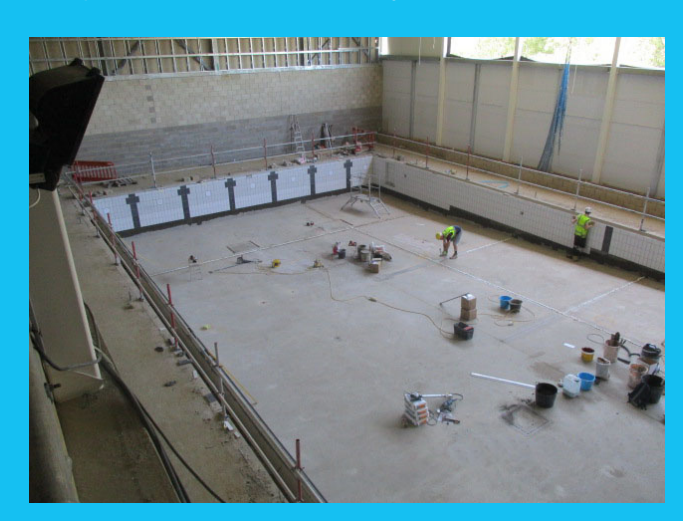
Tiling of the main pool will be completed by mid July.