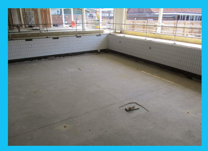
Teaching pool being tiled ahead of the moveable floor being installed at the end of July.