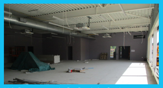
Main fitness area on the first floor being fitted out.