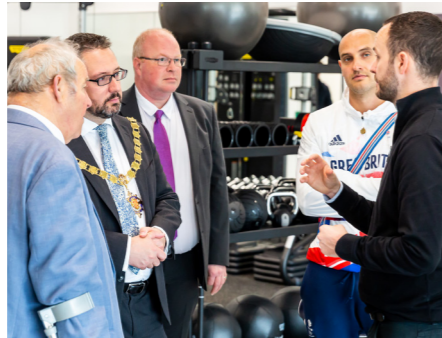
Special guests receive a guided tour of the Eastwood Leisure Centre