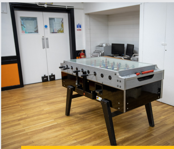
Inside the revitalised Sheerwater Youth Centre

Woking Tigers is run entirely by volunteers so needs your support. If you would like to volunteer at the centre, run a class, hire the venue, or could offer a financial or in-kind donation, please email info@wokingtigers.com