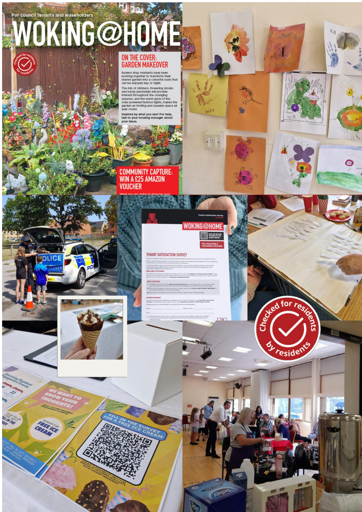
^Collage of Resident Engagement opportunities which have been occurring between February 2024 and December 2024.