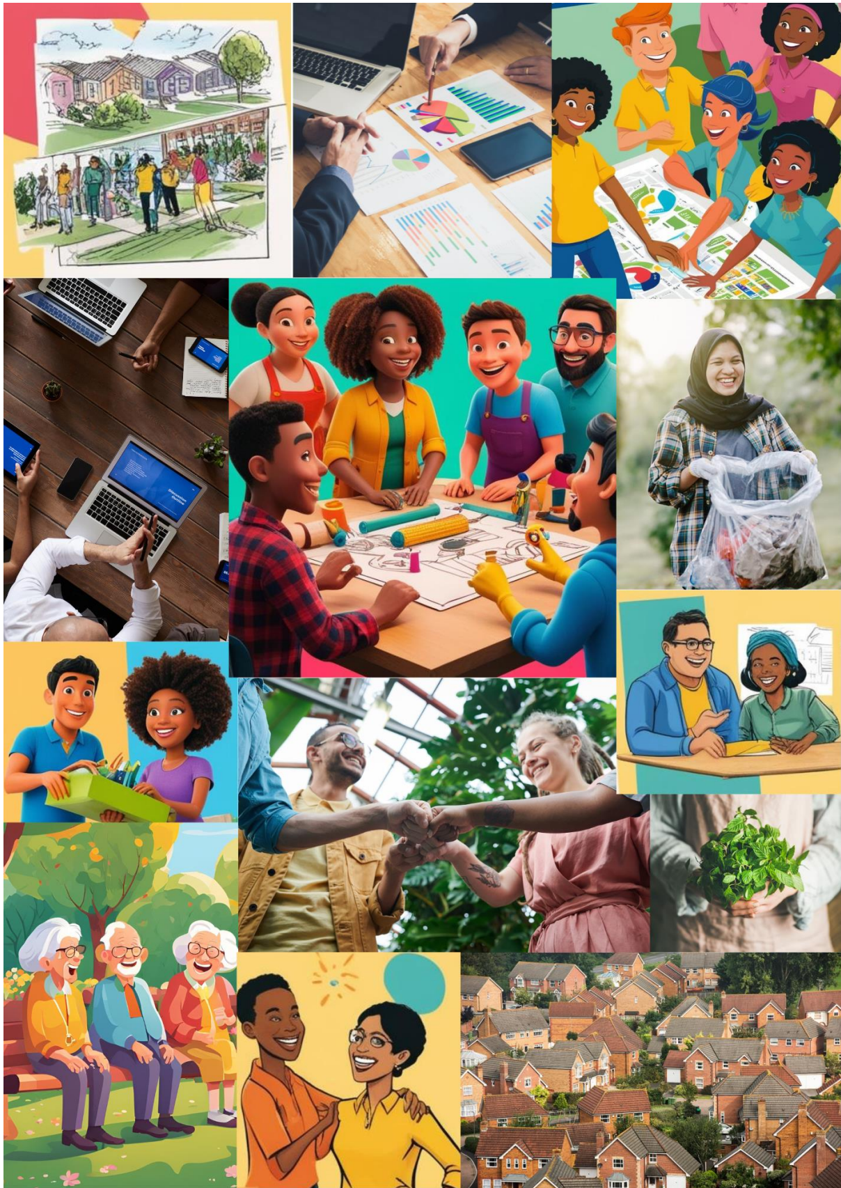
^Collage of stock images and AI generated images to represent Housing Resident Engagement.