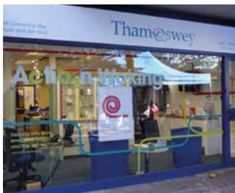
Action Surrey advice centre

Through a variety of simple measures, Action Surrey can help your employees become less energy reliant and save money on their energy bills. Free membership of Action Surrey provides access to the online community and a range of exclusive guides, from saving water to the opportunities presented by the Government's Green Deal.