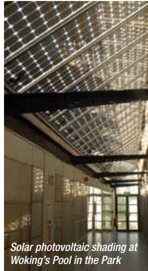
Solar photovoltaic shading at Woking's Pool in the Park